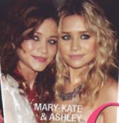
MARY-KATE & ASHLEY