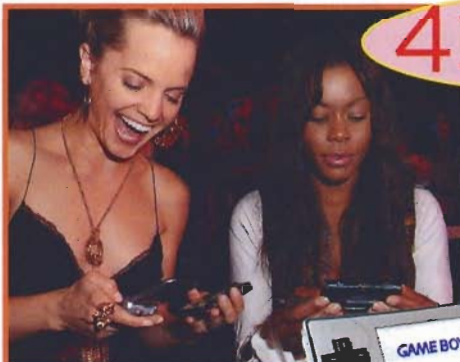
Mena Suvari (left) and Golden Brooks